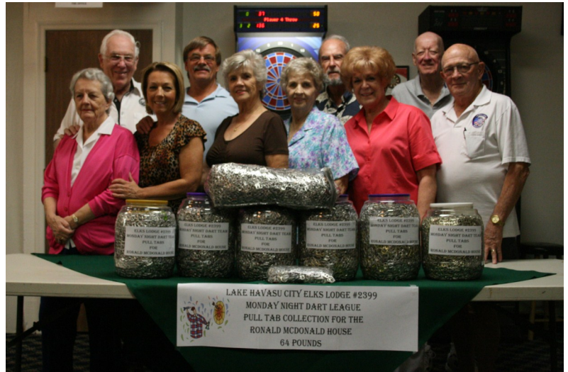
The Elks Dart League Collected Pull Tabs For Ronald MacDonal.

Become an active part of your lodge and get involved with the day-to-day activities. If you don't attend meetings you have no say in the lodge programs. Let your opinion be heard! As a rapidly growing lodge there are many problems to be solved. Be part of the progress, not a deterrent!