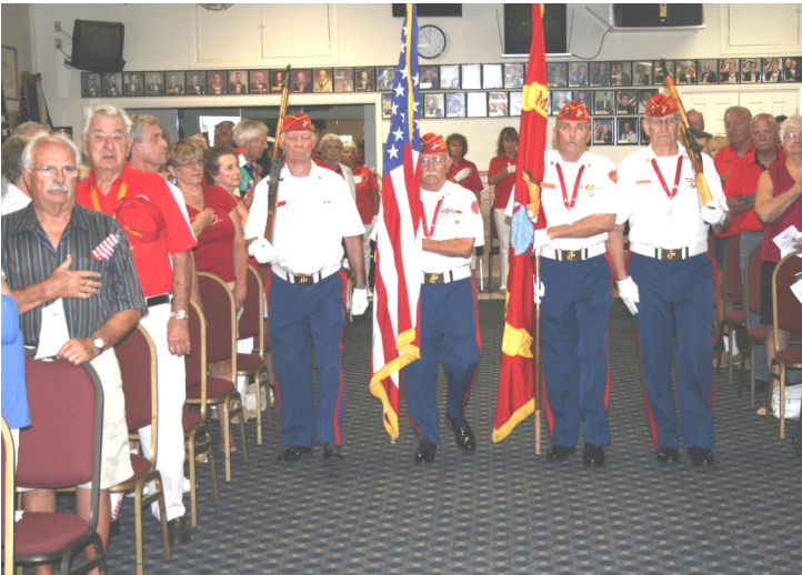
The Lake Havasu Marine Corps League and the Marine Corps League Ladies Auxiliary assisted the Lodge Officers in paying tribute to our Nation's Flag.