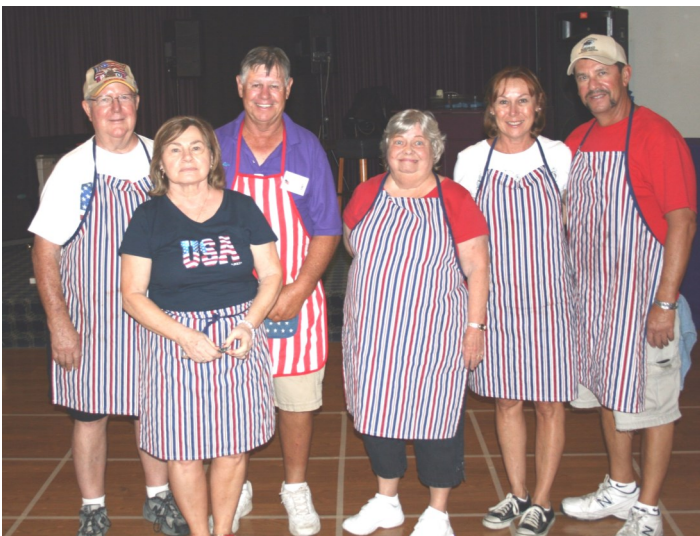
The lodge Hamburger Crew came through again to make the 4th of July Picnic a huge success by providing hot dogs and hamburgers to compliment the member tasty pot luck. The event was enjoyed by all with the ever popular horse race program, 50/50 draw and camaraderie.