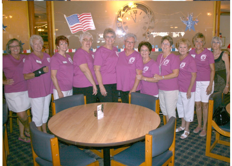
The lodge PERs prepared breakfast for Father's Day and the Lodge Elkettes served the sumptuous meal. The Father's Day event was enjoyed by a large number of lodge members and their families.