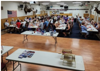
August 2023 LCR Fun

All proceeds benefited the Lodge Expansion Fund