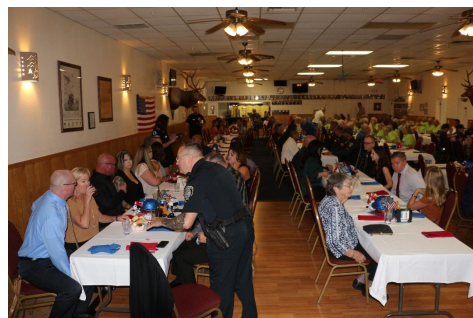
Law and Order Appreciation Dinner attendees.