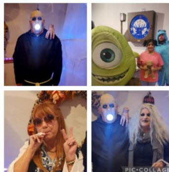
"Halloween Costume Party Winners"