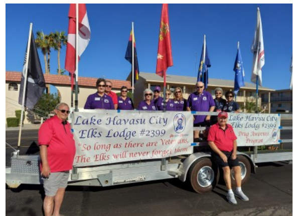
Elkette Officers, PER's and Elkettes ready for the Lake Havasu City London Bridge Day Parade.