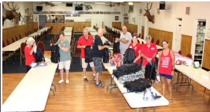
Volunteers packing Back Packs for the annual Veterans Standdown with essential items needed such as tarps, hygiene supplies, food items, water bottles, drinks, socks and food.