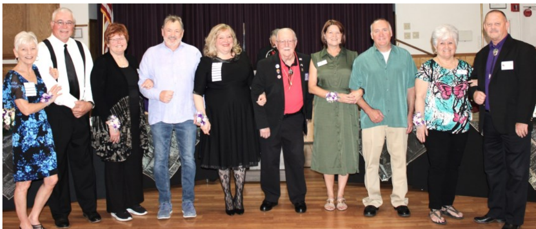
Elkettes 2024 - 2025 Incoming Officers and their Escorts