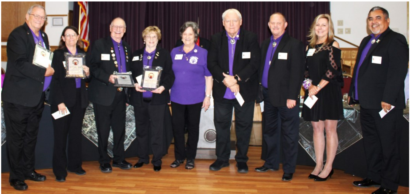
“Fraternal Year 2023-2024 Outgoing Officers”