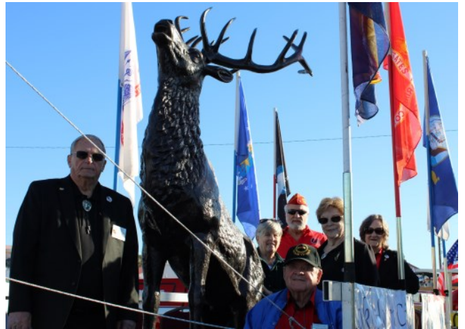
Pictured above and right are Elk Members riding our Float in the Veteran’s Day Parade on November 11, 2024. Following the Parade Members and guests attended a gathering at the Lodge for “Free” Hamburgers, Hot Dogs and Chips for Veterans.