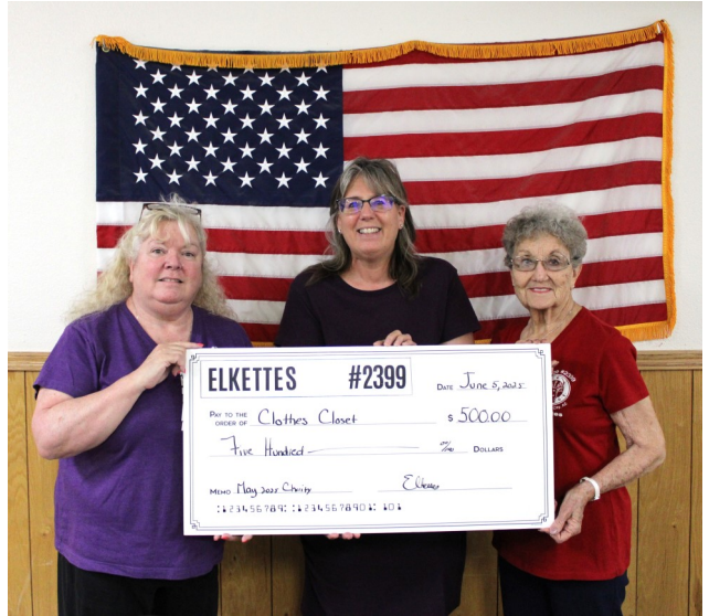
The Elkettes donated $500.00 from the partial proceeds of May pie sales to The Clothes Closet in Lake Havasu City. During the dinner hour, the Elkettes sell pie at $4.00 per slice, to help charities in the community.