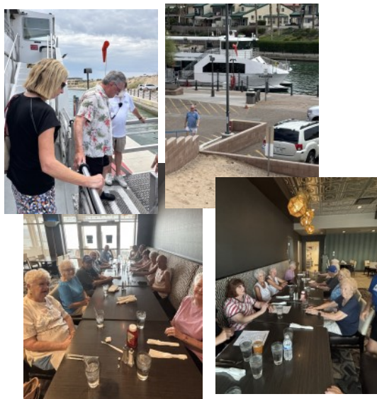
Lunch at the Casino