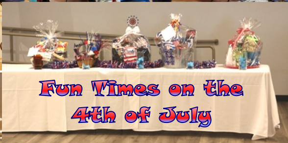
Fun Times on the 4th of July